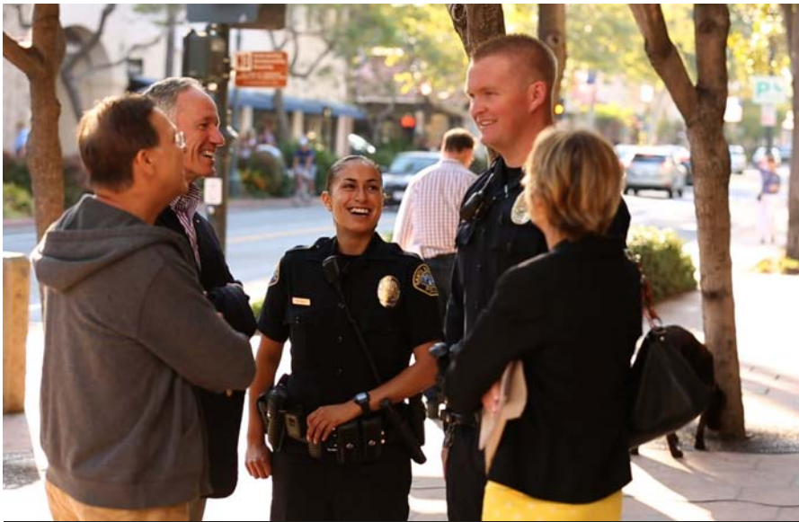
Dedicated to Serve